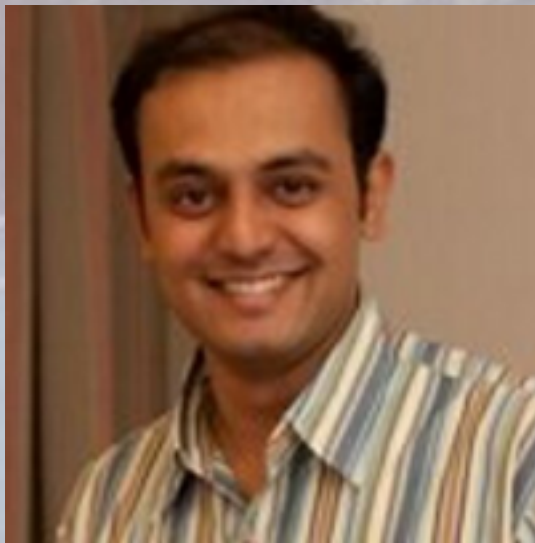
Gautam Rege @gautamrege